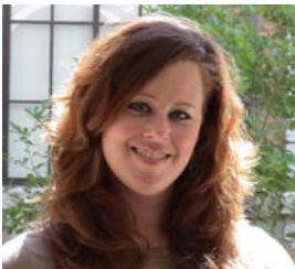
Mary Mulready Hogg Middle School, Houston, TX