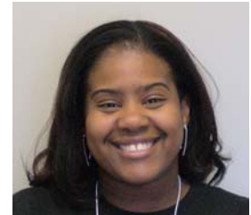
Kristy Love Hogg Middle School, Houston, TX