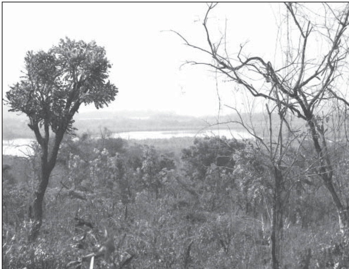
Figure 2: Upper Rio Pongo.

tended that far from the river. Therefore it is unlikely that any artifacts would be associated with village activities. Although no remains of structures were visible here, an extensive scatter of local pottery was present on the surface. This pottery could correspond to the activities of feeding captives prior to their embarkment on slave ships. The local ceramics present appear to be the same type that was found at both the church site and the “palace site,” suggesting contemporaneity with these 19th century sites. The lack of visible architectural remains is not surprising, given that a slave holding area would be unlikely to consist of more than lightly built or temporary shelters of wood and thatch.