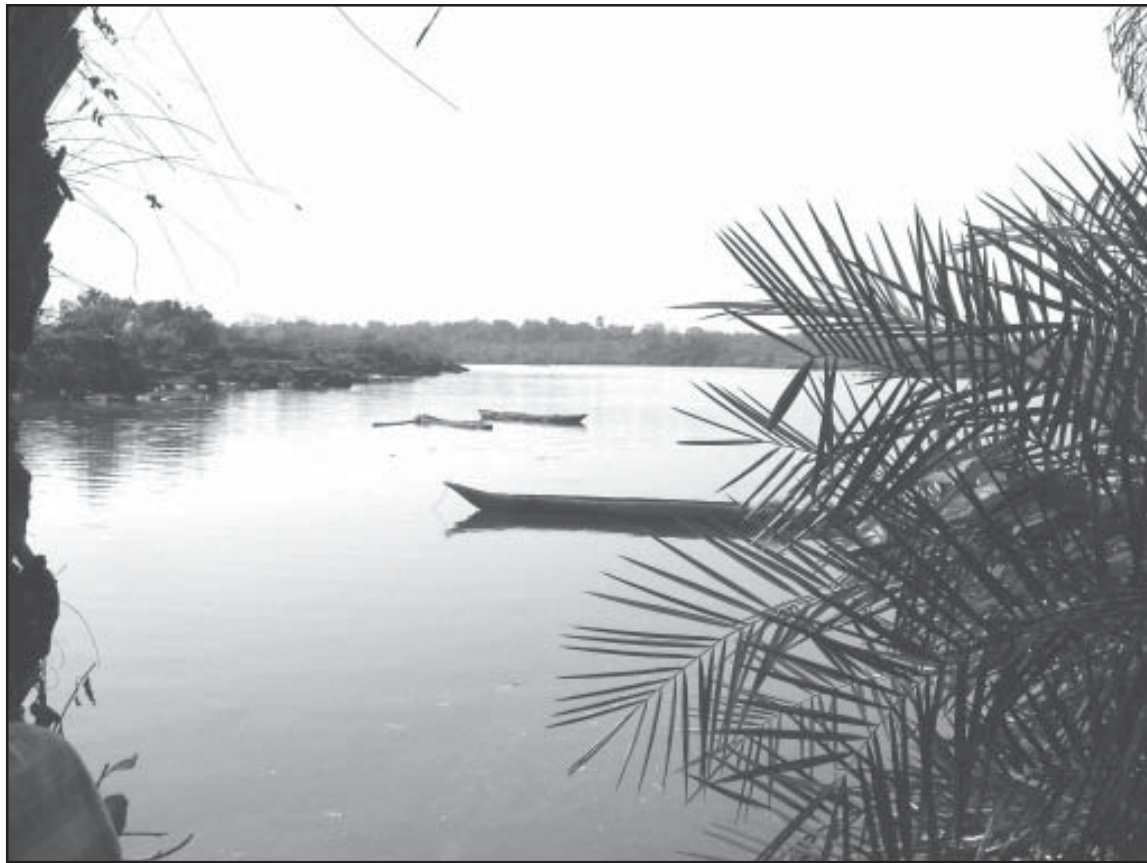
Figure 8: Sanya Pauli port.

whitewares, bottle glass as well as a gunflint. The presence of creamware and pearlware ceramics at Bangalan, and not at Farenaya, clearly indicates that trading activities began earlier at Bangalan than at Farenaya, or for that matter, Sanya Pauli. Stretching over 100 meters between the Lightbourn house and the port, a substantial paved masonry ramp and road is still present. Further inland from the Lightbourn house is a large area with imported glass and ceramics as well as considerable quantities of locally manufactured pottery. Additionally, a single blue bead was found during the reconnaissance. Although no structural remains are visible in this area, the nature of the archaeological materials suggests that this area is very likely the site of the contemporary village associated with the trading post.